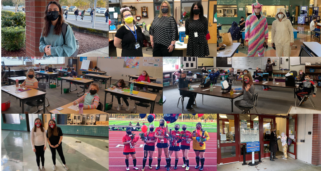
Even masks can't hide the excitement of being back on campus!